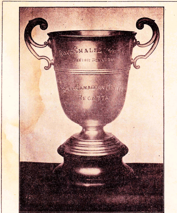
MUIR CHALLENGE CUP FOR JUNIOR SINGLE SCULLS

Here is the full page layout promoting the trophy as it appeared in the early programmes. This is from the 1910 programme, but it appears the same in earlier programmes.